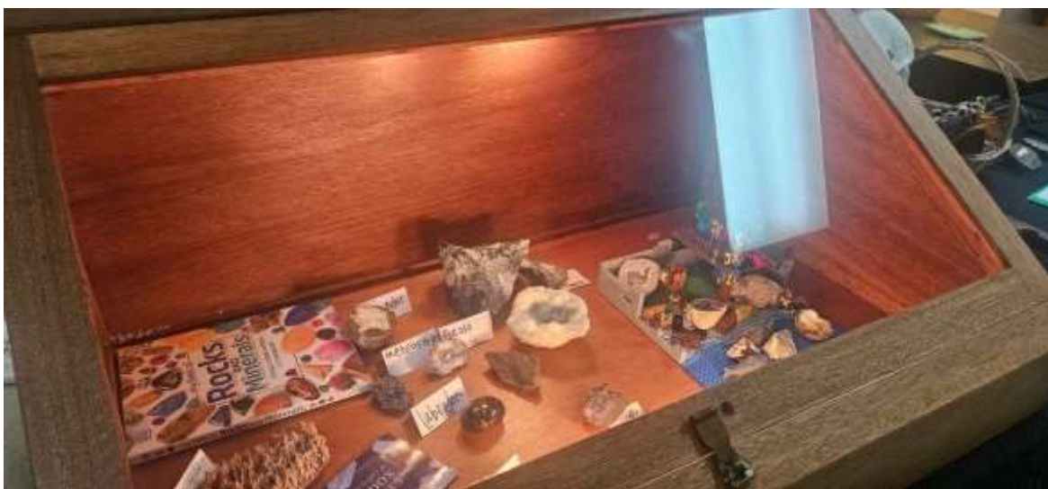
Juniors display at the 2024 Annual Showcase