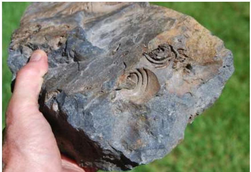
photo here shows a chunk of the dark-colored rock with fossils exposed at the end of the rock. A close-up image is at the top of the next page.

As we walked past the gate to the lookout, my son noticed that some of the dark-colored rocks in the cut slope next to the road had strange-looking holes in the rock. These dark-colored rocks are exposed on the right side of the access road in the photo above. I walked over to the rock exposed in the road cut and took a look. To my surprise, the holes in the dark rock were marine shell fossils! The