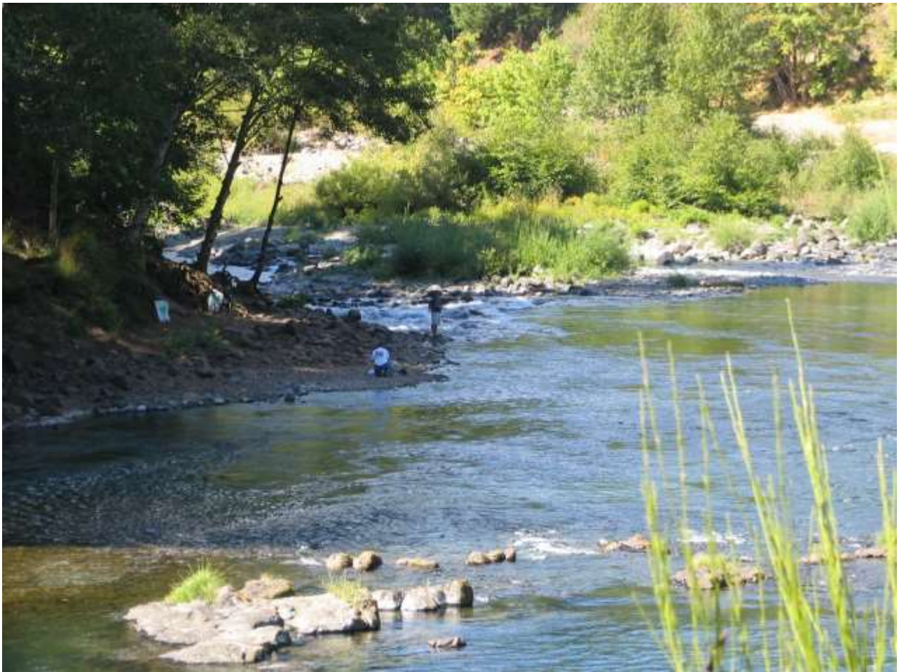
The Umpqua River near Roseburg, Oregon and the "One More Rock" show in May. Photo by Llywrch . This image is published here under the Creative Commons license, CC BY 2.5 .