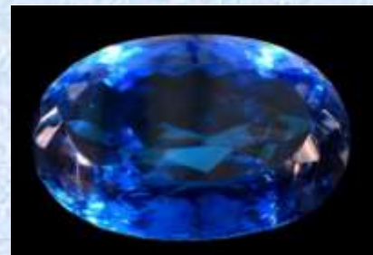
Blue topaz from Minas Gerais, Brazil; 9,381 carats; by Hans Hillewaert ; CC BY-NC-ND 2.0