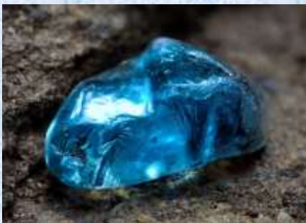
Blue zircon crystal by from Ratanakiri Cambodia; by Martin Heigan ; CC BY-NC-ND 2.0

Your birthstones are blue zircon, blue topaz, and tanzanite