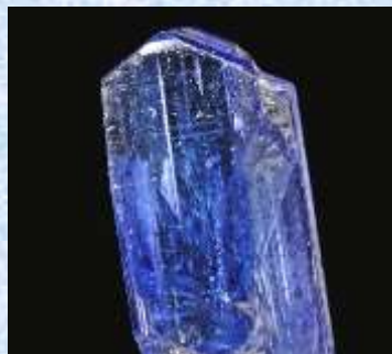
Zoisite variety of Tanzanite from Merelani Hills (Mererani), Lelatema Mts, Arusha Region, Tanzania