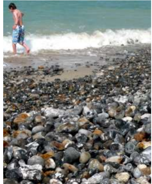
Boy on a rocky beach