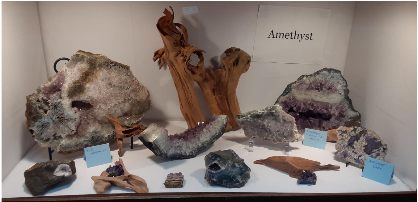
Linda's display of amethyst