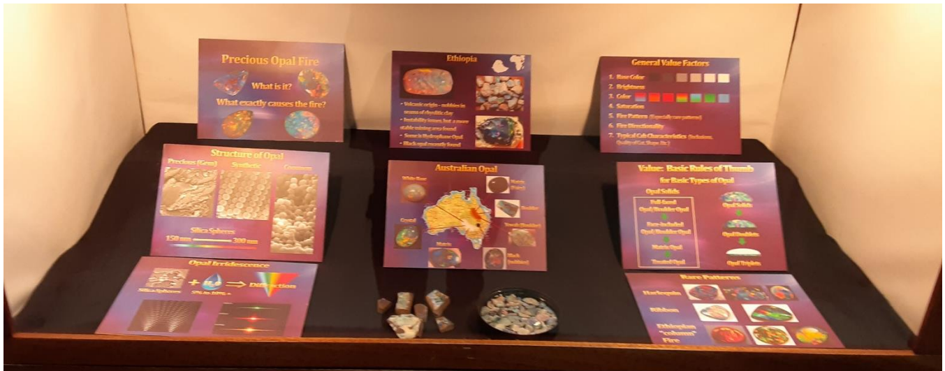
Gary's display of opals