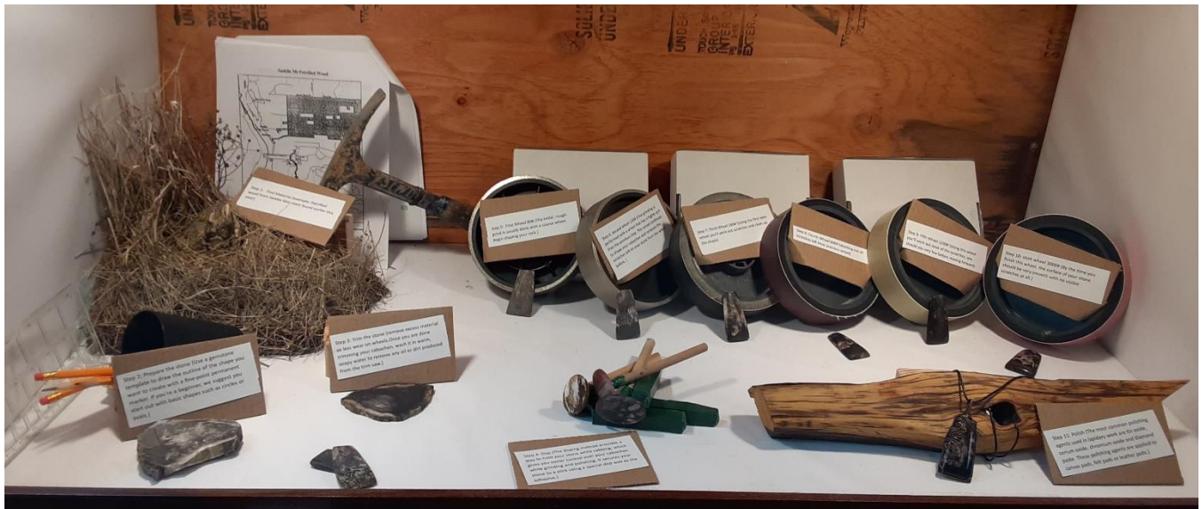
Lynz's display showing stages from raw rocks to finished cabichons