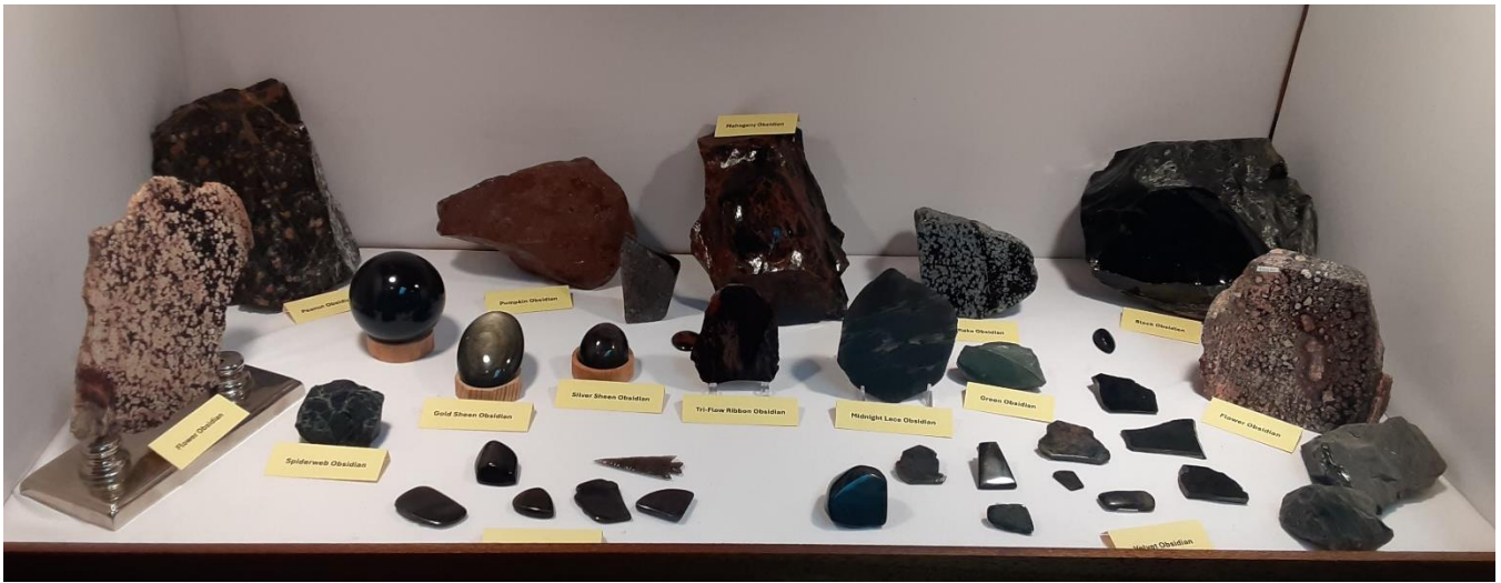
Bruce's display of obsidian