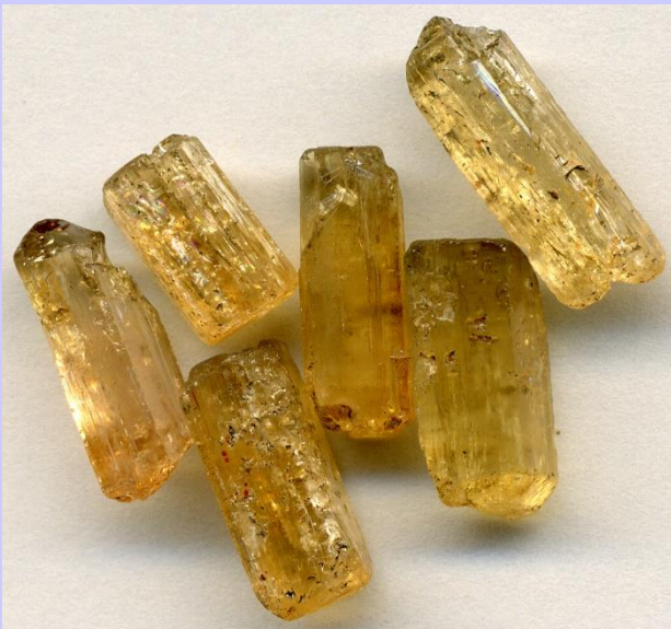
Topaz

While the island was called Topazios, people thought peridot was the same as green topaz, and an abundance of peridot was found there. Topaz crystals are shown below, left. On the right is an olivine crystal from Topazios Island.