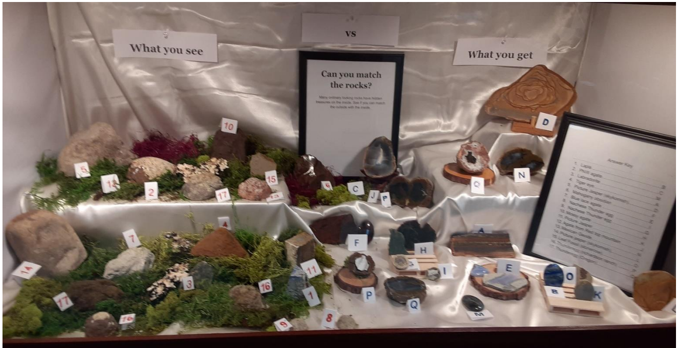
Ed and Ashok's display of raw and finished specimens