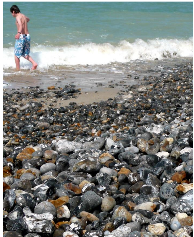
Boy on a rocky beach