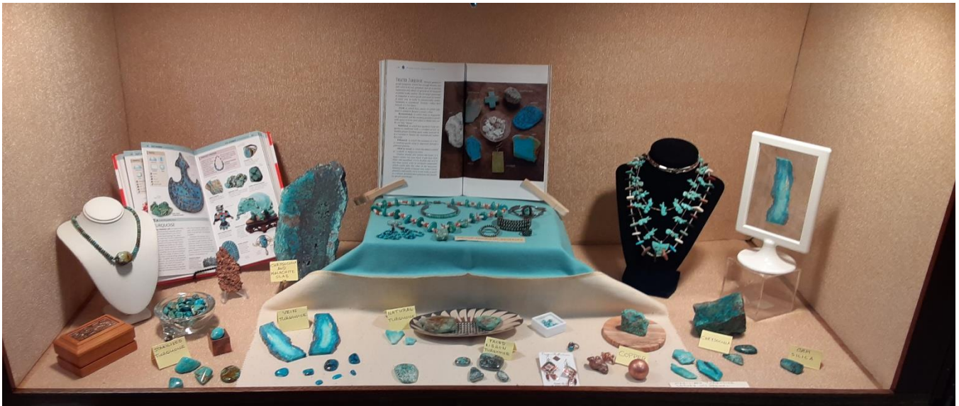
Ashley's Turquoise display