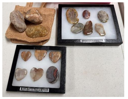
South Dakota agates