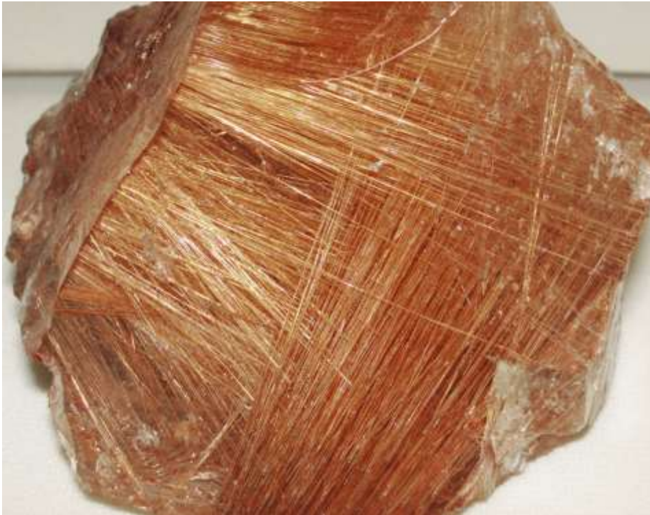
Rutilated quartz from Minas Gerais, Brazil

Here is some rock candy for you to enjoy.