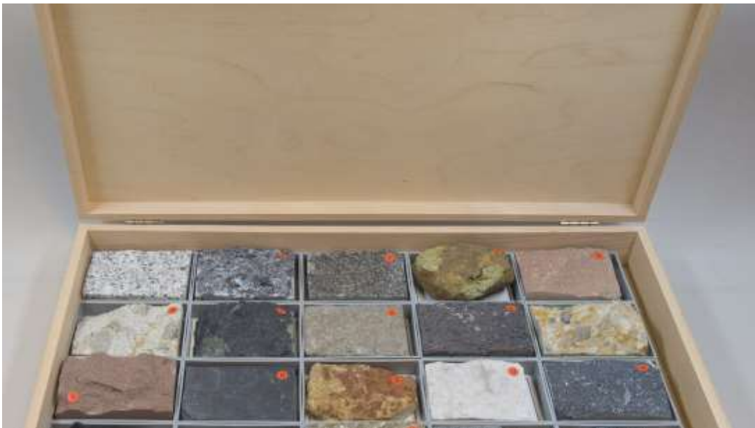
Rock collection; by Hannes Grobe; CC BY-SA 4.0 ; Wikimedia source

In summary, storing and showcasing a rock collection can be both practical and aesthetically pleasing, while also providing educational and personal fulfillment benefits.