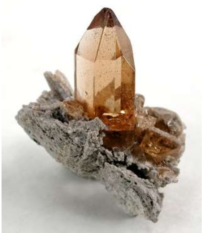
Sherry colored topaz