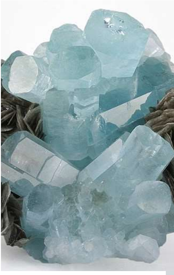
Aquamarine, a form of beryl by Rob Lainsky, iRocks.com ; CC BY-SA 3.0

If eye candy is a picture of something beautiful to look at, then these pictures are Rock Candy for your enjoyment.