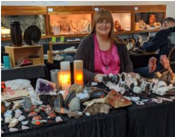
A vendor at one of our shows

Have you been looking for a way to get more involved at the club? We need one or two people to manage the club's table at the upcoming show. It's a fun way to meet a lot of rockhounds while making a little money for the club.