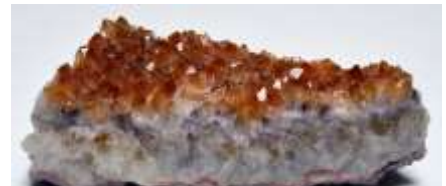
This citrine specimen is an example of what you might have a chance to bid on in the silent auction

You will want to bring cash or a check to buy raffle tickets and to bid in our silent auction. Beautiful and interesting specimens are sold in our silent auction and raffle each month.