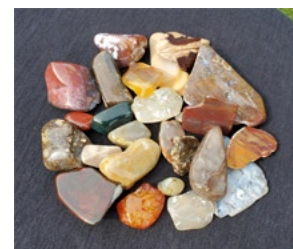
Polished rocks for Show and Tell

The aquamarine in the banner photo is a vibrant aqua blue specimen from Nagar, Hunza Valley, Pakistan. The photo is by Rob Lainsky of iRocks.com . License: CC BY-SA 3.0