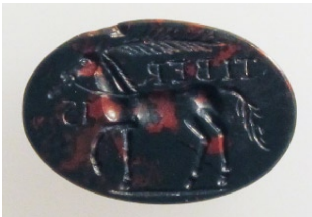
Heliotrope intaglio (seal); 3rd Century CE

The name, Tiber, is carved backwards, because this carved stone was used as a stamp.