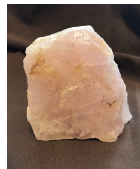
Rose quartz This is an example of a rock that you might see in the silent auction.