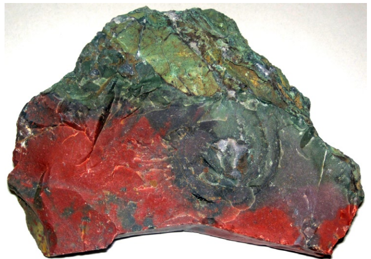
Bloodstone which is a type of quartz.

To seal a letter the writer dripped hot wax on the envelop, and pressed this carved stone into the wax to leave a mark that identified the sender. In the cooled wax the image would be correct, not backwards.